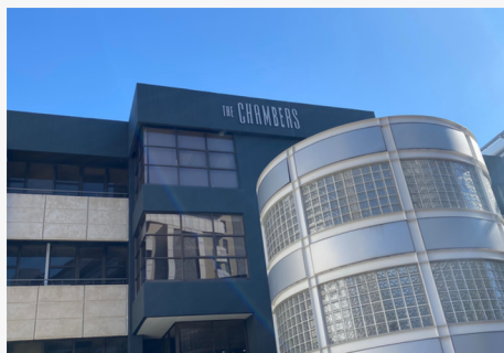
The Chambers, Sandton