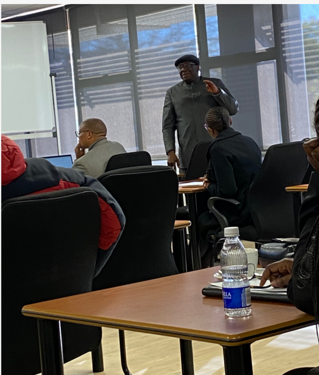
Erudite Judge President Mlambo

The Committee endeavours to roll out Court Online to all courts. The Committee is conducting training and follow-up sessions with users in different provinces. There is a help desk in Johannesburg High Court for further assistance. The Committee trained users in appellate courts and it is still training other court users. The system is ready to be rolled out and access to court is entrenched stage by stage.